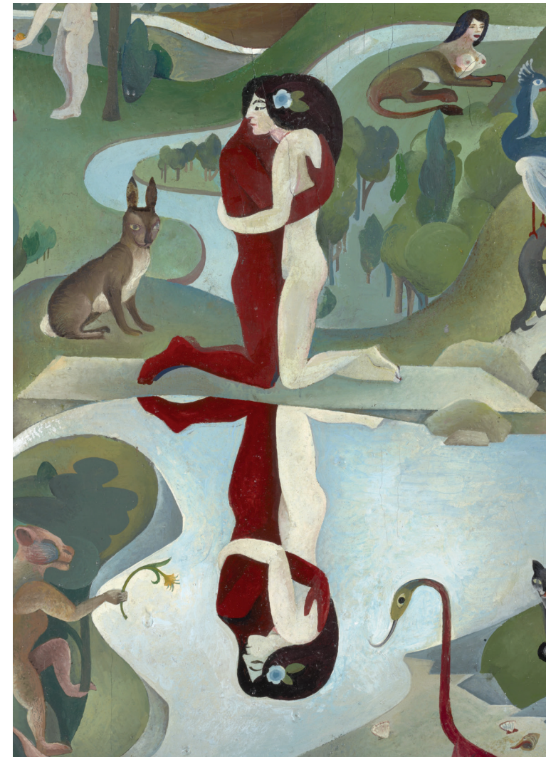
Cover image: "Eden and After" (detail) © Alasdair Gray Scottish National Gallery of Modern Art

ASLS ANNUAL CONFERENCE 2016 1-2 JULY, ST ANDREWS BUILDING UNIVERSITY OF GLASGOW